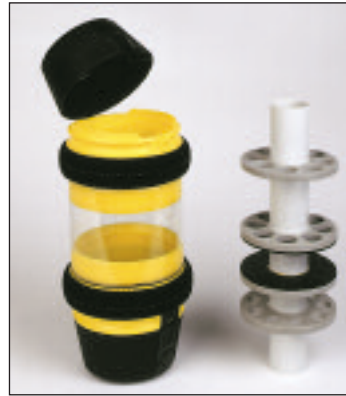
Carrier with test-tube insert

Our new carriers are equipped with seals which prevent liquids from escaping. This ensures trouble-free operation of the system and reduces the risk of infection.