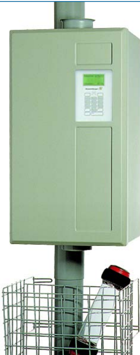
Station DRT NW110 with basket