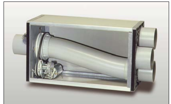
Triple diverter NW110 with S-shaped tube