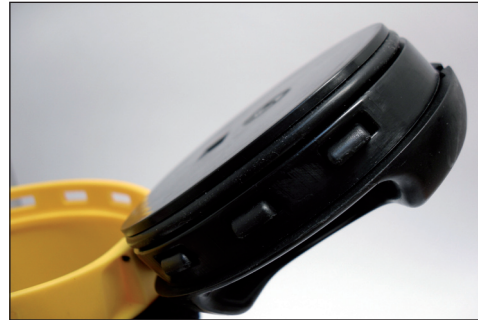
Gaskets prevent leakage of liquids