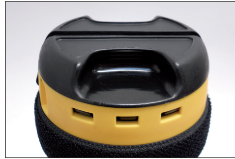
Patented swing top closure

One-sided closure offers clear and better handling and ensures that the carrier is always open from the "right" side.